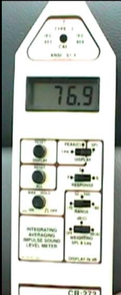
Cirrus (CR:272) Integrating Averaging Impulse Sound Meter